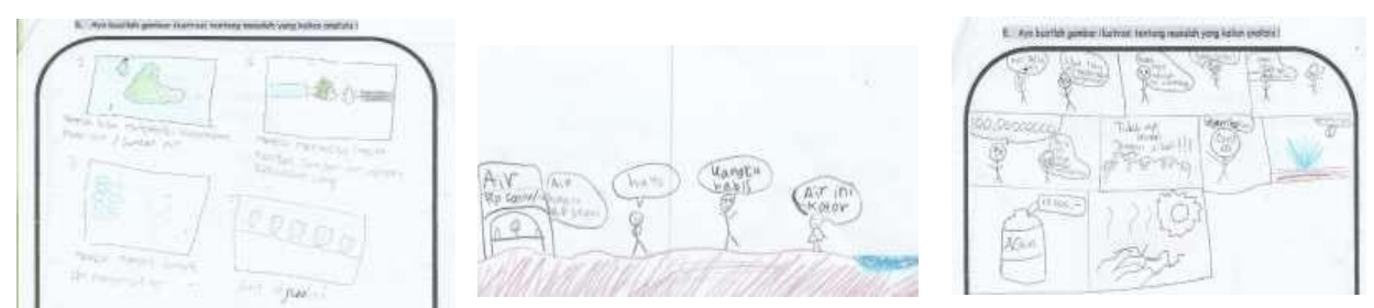
Figure 1. Critical Illustrative Pictures of Water Privatization

In addition to answering several questions, the students could illustrate the issue of water privatization with interesting and witty pictures. As in the picture below: