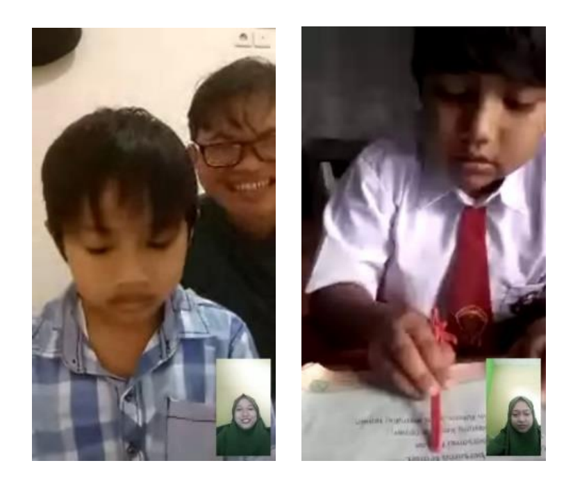
Figure 1. Documentation of the "reading motivation" group selection stage

pandemic is to create a "one day one page" strategy with the media book "read" in the "reading motivation" group. The group was created with the aim of classifying and monitoring students who cannot read yet. To determine the students' reading skill, an observation stage was initially held using the WhatsApp video call media . Here is a document on the "one day one page" strategy and the "ready spirit" group.