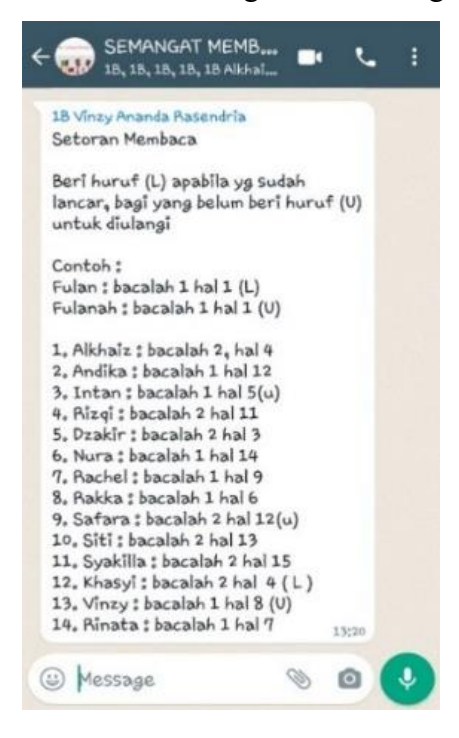
Figure 2. Documentation of daily reading deposit reports

Figure 1. Documentation of the "reading motivation" group selection stage