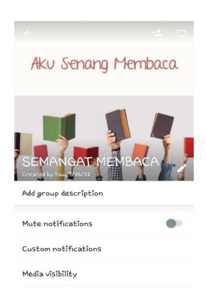
Figure 3. WhatsApp groups as daily reading deposit media

PrimaryEdu : Journal of Elementary Education Volume 6, Number 1, February 2022