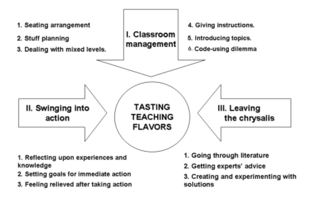
Figure 2. Emerging categories and sub-categories.

new world, the classroom, and learnt how to deal with all the new situations they had to confront in it. In our study, through examining the frequency of our data, we found situations that were "new flavors" for the student-teachers. These were related to language use, how to organize children in the classroom, materials choice and organization, management of mixed ability groups, how to give instructions, and topic introduction; aspects belonging to classroom management, what is considered to be the effective way in which the student-teachers develop their classes in order to ensure that children work and learn in a comfortable and productive environment.