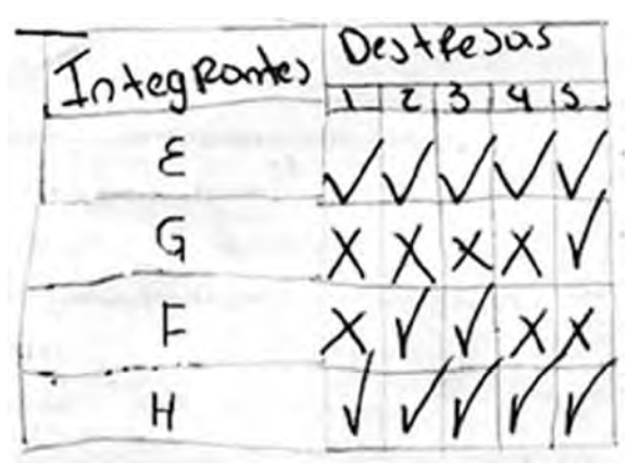
Figure 3. Lesson 2, Group 2 Processing-Chart<sup>2</sup>

In Lesson 2, for example, the cooperative skills students evaluated were: