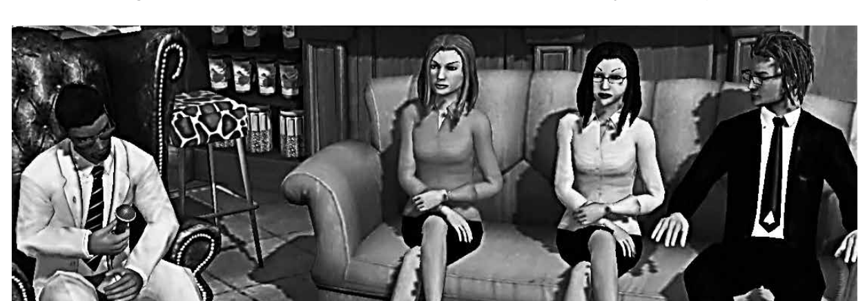
Figure 1. Scene in a Moviestorm-Machinima 3D Video Created by the Participants

According to the Moviestorm official website (www. moviestorm.co.uk), "this is a 3D real-time software used to create animated films with machinima technology". It is licensed software which has been used in the educational field with students of different educational levels to recreate situations of everyday life, using avatars that allow them to have another identity in the virtual world.