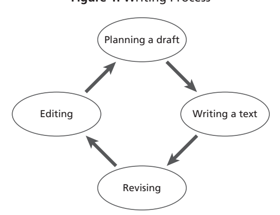
Figure 1. Writing Process

Nowadays learning to write is conceived as a task that follows a process that contains different stages as Figure 1 shows.