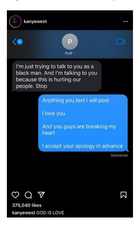
Figure 2: Screenshot of @kanyewest Instagram post (West 2022c)4

Social media technology is crucial to West's persona because it facilitates his interaction and connection with various micropublics through online sharing. When his Instagram page is "live", it is constantly being edited as posts are subject to appear, disappear, and reappear within minutes. Posts feature images (artistic visuals, memes, as well as photographs culled from the