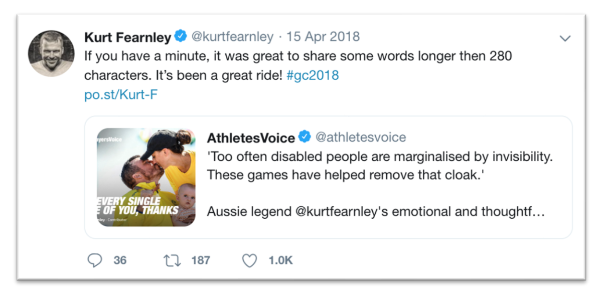
Figure 3: Screenshot of Fearnley's tweet/link to AthletesVoice (Fearnley 2018b; Fearnley 2018d).

Figure 2: Screenshot of Fearnley's inclusivity tweet (Fearnley 2018c).