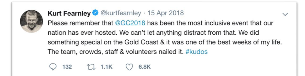
Figure 2: Screenshot of Fearnley's inclusivity tweet (Fearnley 2018c).