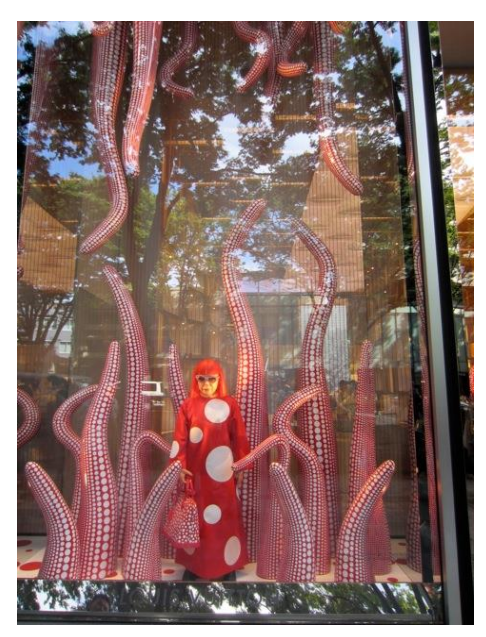
Fig 2: Louis Vuitton Tokyo Omotesando store window display in Aug. 2012.