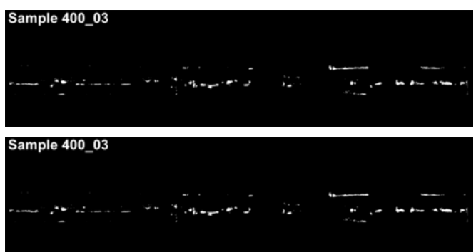
Fig. 2. Exemplary results of radiogram thresholding using optimised processing chain.

classification is taken in the subsequent steps. Thus, a 100% efficiency in this stage of the processing is not expected.