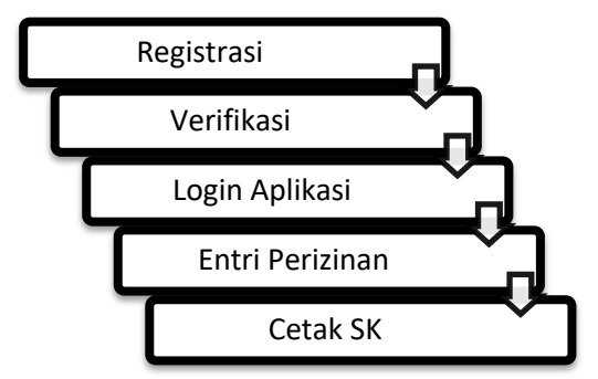
Figure 3 Licensing Procedures through Si Pintar Solo