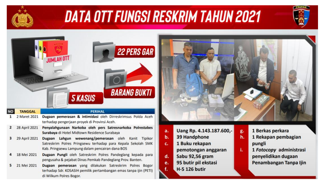
Figure 4. Recrime Function's Hand-Catching Operation (OTT) Data in 2021

c. The Hand-Catching Operation (OTT) was carried out by the internal security of the Professional and Security Division of the Indonesian National Police, which is an internal supervisor for Polri personnel who have committed violations related to bribery.