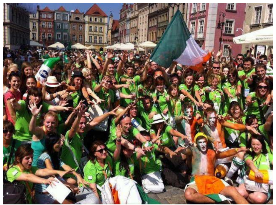
Fig. 2. Volunteers working in the municipal area of the UEFA Euro 2012 in Poznan integrated with Irish football fans.

Center for Urban Transport – CKM emphasized the social nature of its program encouraging the participation under the slogan "We are the hosts" while pointing out that it is a work in urban space gives you the feeling of a real host of the tournament. Participation in this program was to build the atmosphere of a football feast through integration with other program participants, fans and tourists (Fig. 2).