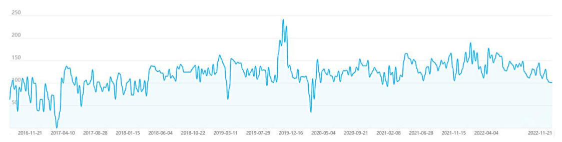
Figure 1 Baidu Search Trend for master of physical education

It is found that the search trend of school sport and master of physical education is similar (Figure 2). However, the average value of school sport is higher than those of master of physical education from the overview of the search index (Figure 2). The main reason is that the Chinese Ministry of Education vigorously advocates school sport and issued a notice on strengthening the study of sports as early as 2012 (Ministry of Education, 2012). Therefore, when the relevant policies of school sport are introduced, people's retrieval habits are more inclined to directly type school sport to search information. As a result, the overall daily average value and mobile daily average value of "school sport" are higher than that of master of physical education.