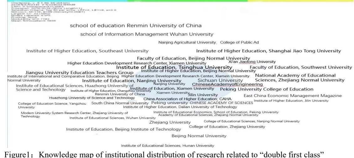
university construction in China

The present study utilizes CiteSpace analysis to examine the number of documents issued by various agencies and the extent of inter-agency cooperation in the period of 2016-2019. In line with established parameters, the values of C, CC, and CCV in threshold interpolation are set to (3, 3, 15), while the node types are limited to institutions. Specifically, the data of CSSCI source journals from the past three years are input into the CiteSpace software system for analysis, revealing N = 116 and E = 58, with a density of 0.0087. These findings suggest the existence of 116 institutions with more than three papers published in 1006 CSSCI journals, with 58 institutions engaging in cooperation, constituting 50% of the total number of institutions examined.