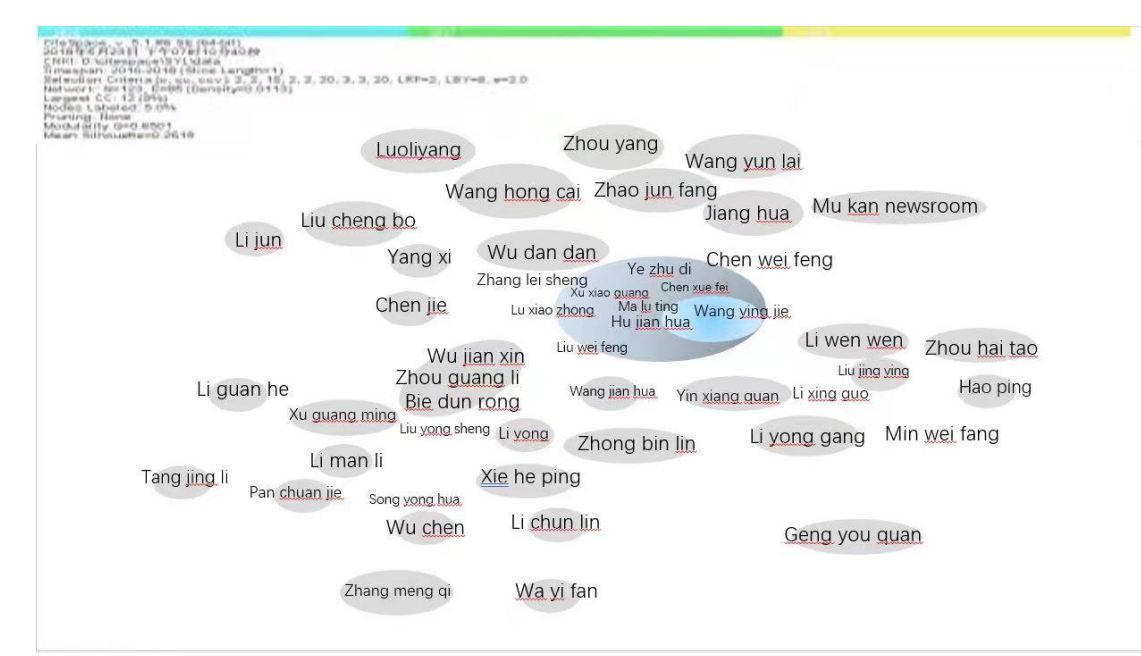
Figure 2: The author's contribution knowledge map of "double top" related research

From the results of Figure 2, table 2 and the author's discipline background investigation, it can be seen that among the 123 author groups of "double top" construction related research, they are mainly domestic experts and scholars who have been engaged in Higher Education Research for a long time, followed by experts and scholars who are engaged in comparative higher education research, and there are few authors in other disciplines other than education. This shows that there are few interdisciplinary cooperative papers. Among the "double top" construction related research author groups, there are 31 authors with more than 3 articles published in CSSCI source journals, and the top ranked authors are Wu Jianxin's 9 articles, Zhou Guangli's 7 articles, Bie Dunrong's 6 articles, Zhou Haitao and Sui Yifan's 5 articles.