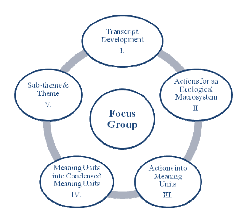
Figure 1: Transcript Analysis and Process

The concept of 'theme' can have multiple interpretations. Establishing themes is a way to link underlying meanings across focus group transcript analysis into categories, according to Polit and Hungler (1999). A theme is a recurring representation of meaning developed within categories or cutting across categories. Authors such as Baxter (1991) define themes as threads of meaning that recur across domains. Other authors argue that a theme describes an aspect of the structure of experience (van Manen, 1990). A theme answers the question 'How?' A theme can be viewed as a thread of an underlying meaning, revealed through condensed meaning units, codes or categories, at an interpretative level (Downe-Wamboldt, 1992; Krippendorff, 1980). For the purposes of the research presented here themes are comprised of sub-themes. The motive for dissecting and (re)presenting the participants' collective narrative is to illustrate the existence of multiple realities and the diversity of these realities, and to allow the reader entry into these localised spaces.