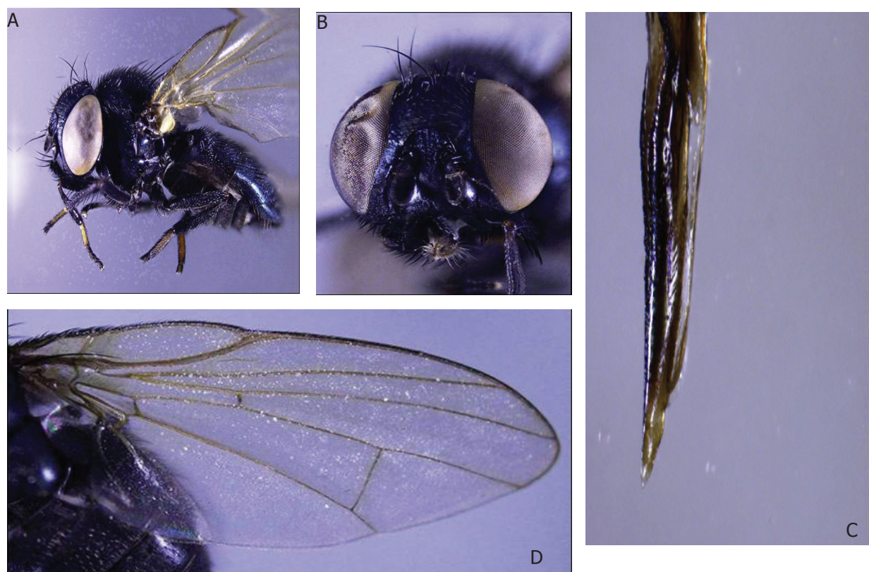
Figure 4. Dasiops chotanus . A. Lateral view. B. Front view of the head. C. Aculeus. D. Wing.

These species were also found associated with purple passion fruit ( Passiflora edulis f. edulis Sims) crops.