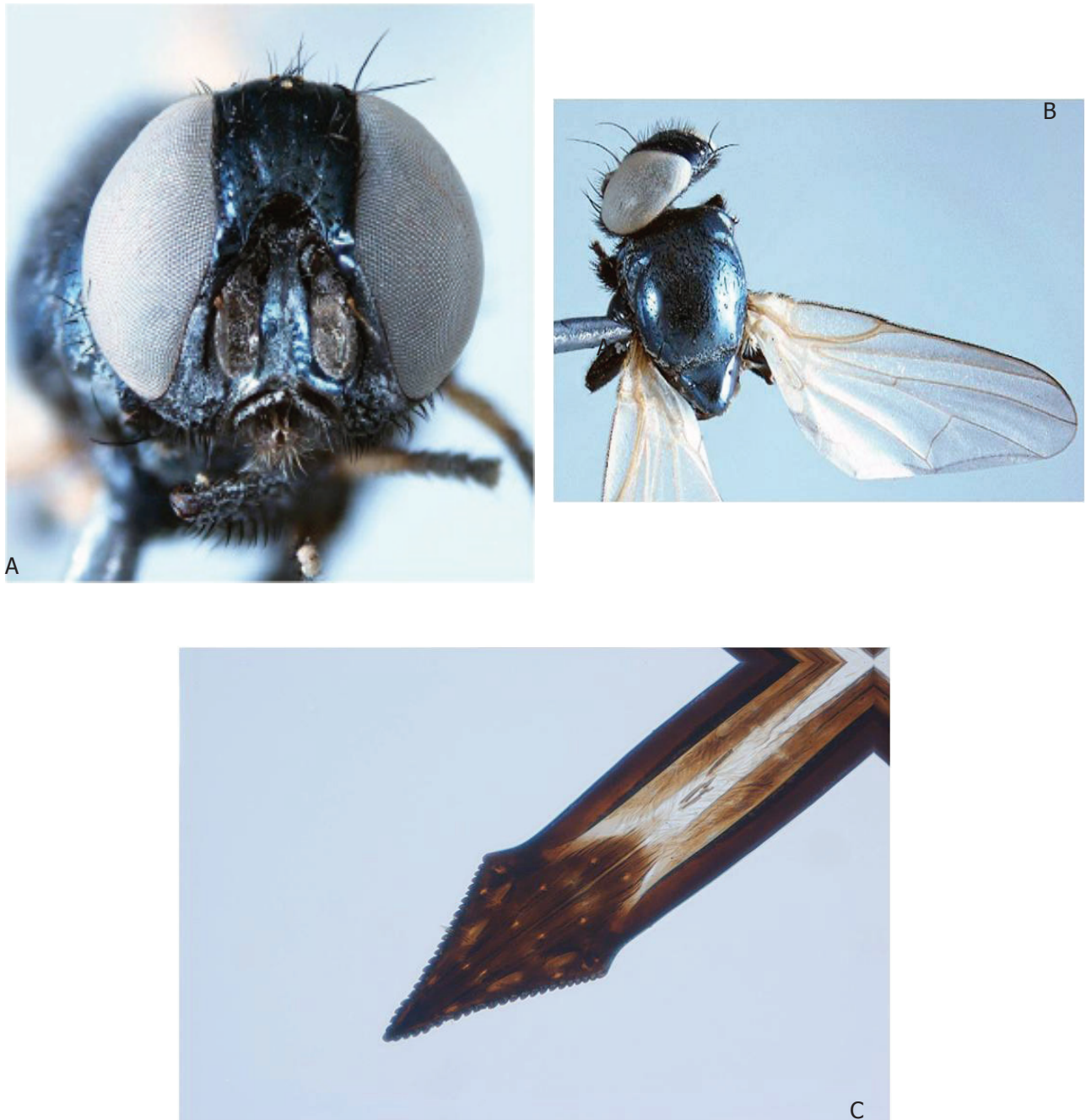
Figure 1. Dasiops brevicornis . A. Front view of the head. B. Dorsal view of the thorax and wings. C. Apical portion of aculeus.

(1996), indicate that D. brevicornis and D. inedulis conspecific species are differentiated only by aculeus length between the first and 2.0-2.03 for 1.26-1.83 mm for the second, and the relationship aculeus- mesonotum between 0.98-1.07 to D. brevicornis and 0.79 to 0.93 times the length of mesonotum in D. inedulis . In this