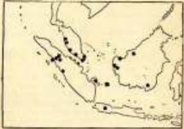
FIG. 9. Tetracera urborescens Jack.

The type specimen of Jack has a label " Tetracera arborescens WJ. Tappanooly," probably in Jack's handwriting, and "Legit Jack Sumatra Occident. 1829" in Hasskarl's handwriting. The original description is insufficient for specific distinction and the binomial has never been interpreted before.