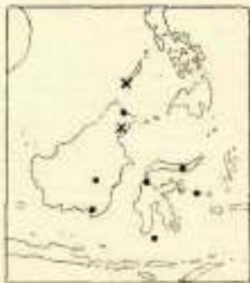
FIG. 7. Tetracera korthalsii Miq.: var. korthalsii (○), var. subrotunda (Elm.) Hoogl. (X).

The differences between the two varieties are found in the shape and, to a lesser degree, in the size of the leaves. Tetracera elmeri Merr. represents a hirsute form.