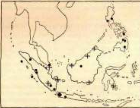
FIG. 10. Tetracera fagifoUa Bl.: var. fagifoUa (●), var. borneensis (Miq.) Hoogl. (✕).

Leaves elliptic to lanceolate, length about 1.4—3.5 x breadth, (2.4—) 6—13(—18) X (1.9—)2.7—5.5(—6.5) cm, with (6—) 8—10(—14) nerves on either side; margin entire; each nerve following the margin closely until it meets the next one, anastomosing with the latter either directly or through major venation.