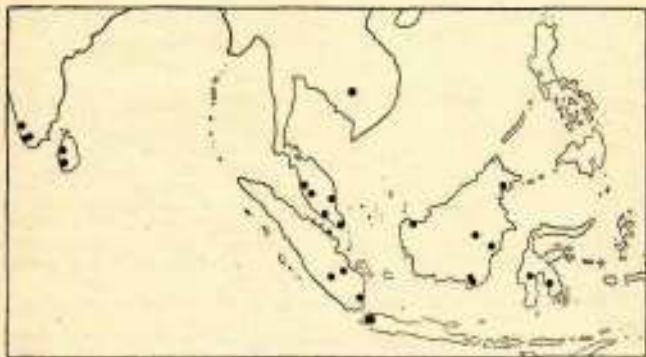
FIG. 5. Tetmcerci akara (Burm. f.) Merr.

DISTRIBUTION.—Deccan Peninsula (Malabar, Travancore), Ceylon, Indo-China (Cambodia), Sumatra, Malay Peninsula, West Java, Borneo, and Celebes.