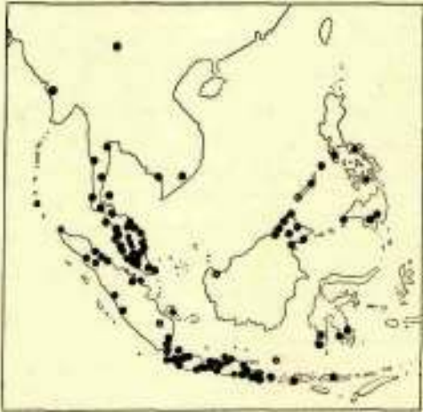
FIG. 1. Tetrastera scandens (L.) Merr.

inside, ciliate at margin. Petals 3, 3—5 X 2—3.5 mm, white, yellowish white, or reddish white. Stamens about 65—80, 3 mm long, white, with thecae touching each other at apex. Carpels 1(—2), densely hairy with rigid, appressed, 0.4—0.7 mm long hairs, ovoid, 0.75—1 X 0.5—0.75 mm with 3 mm long style, with about 10 ovules. Fruits ovoid, about 10 x 6 mm, acute with 1—3 mm long beak, with 0.5—2 mm long rigid, appressed hairs, reddish brown, glossy, 1(—2)-seeded. Seeds ovoid, about 4 x 3 mm, (flossy black; aril 2—3 mm long, scarlet, fimbriate for 3/4 - 9/10 of its length.