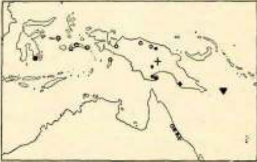
FIG. 3. Tetracera nordtiana F. Muell.: var. nordtiana (•), var. wuthiana (F. Muell.) Hoogl. (X), var. everillii (F. Muell.) Hoogl. (+), var. moluccana (Martelli) Hoogl. (•), var. celebica Hoogl. (•), var. lousiadica Hoogl. (T).

in New Guinea and Queensland; variety moluccana in the Moluccas, Am Islands, New Guinea, and Queensland; variety wuthiana in Queensland and a transitional form to variety nordtium in SE New Guinea (Koitaki); variety everillii in SE New Guinea (Fly River); variety celebica in Kabaena Island (SE Celebes); variety lousiadica in the Louisiades. A single sterile collection is known from New Britain (Kew Herbarium); it probably belongs to variety moluccana .