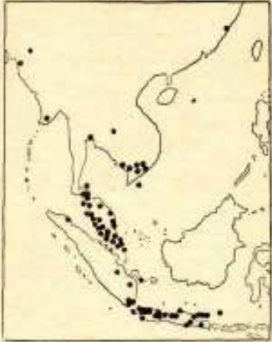
Fig. 1. Tetracera indica (Houtt. ex Christm. & Panz.) Merr.

VERNACULAR NAMES. — Siam: pot luan (Songkla), pot lun (Krabi), yan pad lun (Trang). Indo-China: cay giay chieu, cheait betao ( fide Gagnepain), chon que (Moi; Bien HoA). Sumatra: apas kedjong (Djambi), baih siepiek, baih siepiek suloh, sipik suluh, wajit sipit (Lampung), djelati (Palembang), memplas gadja (East Coast). Malay Peninsula: akar pulas puyio, ma ampalasu akar (Malacca), ampelas lichin ( fide Burkill), ampelas mihsak (Trengganu), ampelas minyak, ampelas payah ( fide Ridley), kalintat niamok (Singapore). Banka: akar tempelas. Java: akar mempelas (tempelas), empelas (mempelas) akar (Malay), (areuj) ki as(s)han, (kaju) asahan (Sundanese), bo (Javanese). Kangean: buko-buko.