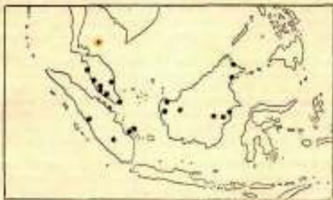
FIG. 8. Tetracera macrophylla Wall, ex Hook. f. & Thorns.

ECOLOGY.—Climber in dry as well as in swampy forests and thickets, up to 300 m altitude. According to Ridley very common in the Malay Peninsula, but rarely in flower.