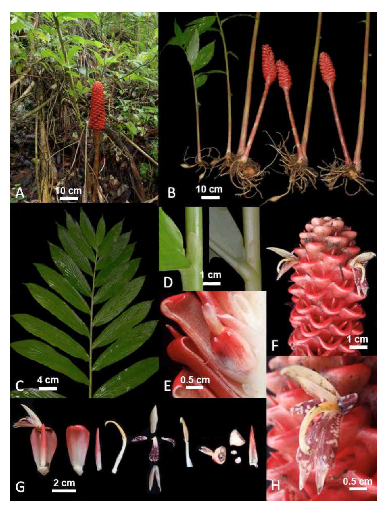
Plate 1. Zingiber engganoensis Ardiyani. A. Habit B. Leafy shoot and the inflorescence showing rhizomes, roots and root-tuber C. Leaves D. Ligule and swollen petiole E. Dissection of inflorescence showing fruit F. Spike and flowers G. Dissection of flowers and fruits showing showing bract, bracteole, two lateral staminodes, two petal lobes, labellum, and the four appendages of the anther H. Flower. Source of materials: E190 (BO).