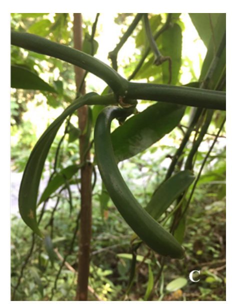
Fig. 1. Vanilla yersiniana in situ, Lenggong, Perak. A. Flower, front view. B. Vines with inflorescences at different flowering stages. C. Fruit.