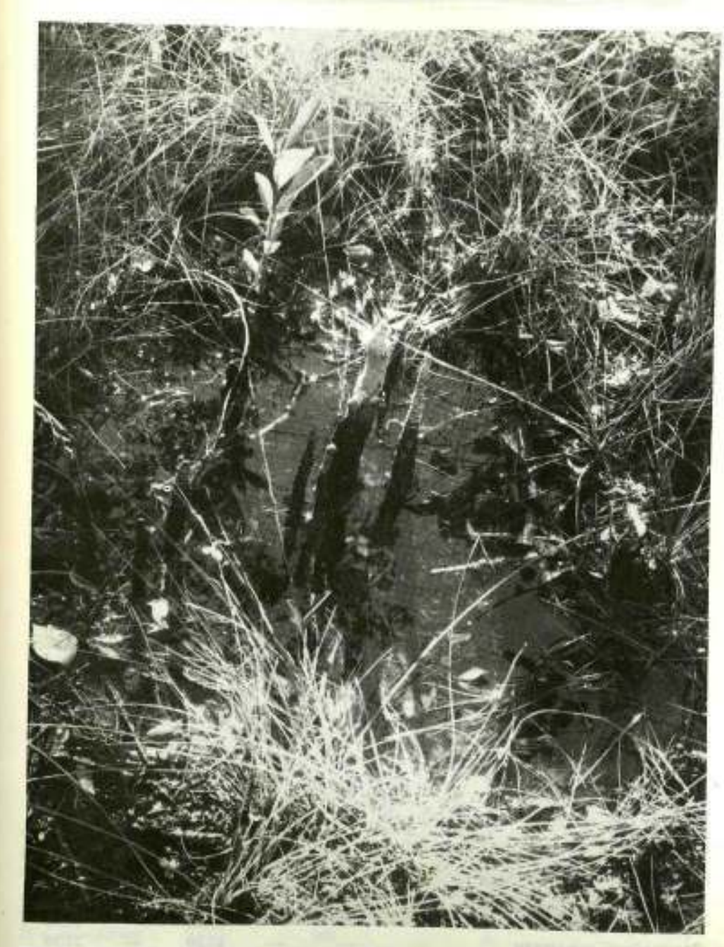
FIG. 4. Stagnant water in a depression in the Cratoxylunu-Dactylocladus commu-nity, with pneumatophores in the center and ground cover around it consisting of Tricostularia undulata, Nepenthes gracilis and seedlings of Tetractomia obovata