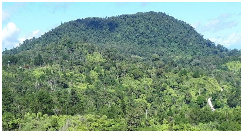
Fig 2. Panoramic view of Mt. Malambo with montane vegetation.

Storage (JSTOR). The classification system used was based on the Pteridophyte Phylogeny Group (PPG I 2016). These specimens were then processed and included in the prepared voucher specimens. All specimens were accessioned and deposited at the Central Mindanao University.