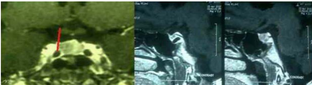
Figure 1 - MRI images of case with Cushing disease with uncontrolled diabetes presented with ptosis due to 3 rd nerve palsy

The issue of Cushing disease remission both clinically and by biological confirmation has been addressed in many reports with overall remission ranging from 59 to 98% in different clinical series. 2,4,5,8,9 Variable factors predict the potential remission rate; the size of adenoma, whether its de novo or recurrent, presence of cavernous sinus invasion and presence or absence of pathological confirmation. Remission rate is higher in newly diagnosed microadenomas without cavernous sinus invasion and slightly higher in pathologically proven adenoma rather than those with inconclusive pathological smear. 1,2,7,12,13,14 We have achieved remission in 80.9% of cases but all of them is microadenomas. In one case; the adenoma was located laterally in close contact with internal carotid artery and despite pathological confirmation of being adenoma; remission wasn't achieved and was sent for gamma knife (Figure 1). Among our three cases with negative pathological confirmation; only one case (33.3%) showed disease remission and other two cases were sent for gamma knife.