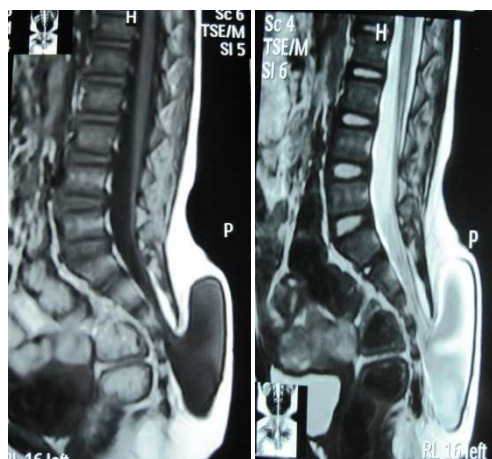
Figure 1 - T1W1 & T2W1 MRI images of saggital cut of spinal cord is showing evidence of dilated terminal portion of central canal, continuing in cyst over sacral region,suggestive of Myelocystocele

Patient was operated electively. A vertical incision was given in midline and about 50 ml CSF was drained. The cyst was explored, opened and found to be in continuation with the central canal. Central canal of cord was found dilated (Hydromyelia). Cord was tethered over S1-S2 region and was low lying type. The peroperative diagnosis was myelocystocele.