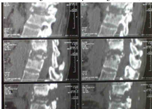
Figure 2 A, B - MRI of the thoracolumbar spine, sagittal reconstruction evidence vertebral collapse