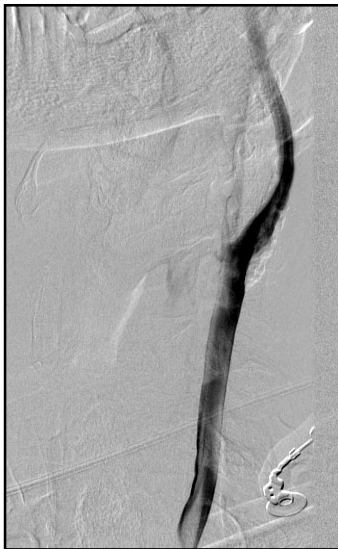
Figure 3 - DSA image of an athermatous left ICA bifurcation

by a combined approach, endovascular carotid occlusion and surgical aneurysm resection.