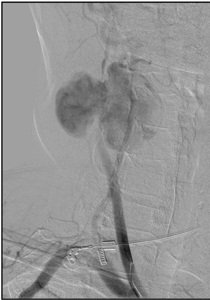
Figure 2 - DSA image of a giant right extracranial ICA aneurysm