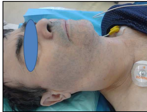
Figure 1 - Patient with latero-cervical mass

The physical examination revealed a pulsatile semi-solid cervical mass located anterior to the sternocleidomastoid muscle (Figure 1). There was an associated pain and compressive symptoms with hoarseness, odynophagia or dysphagia for the last three days. He had no symptoms suggestive of cranial or peripheral neurologic deficits.