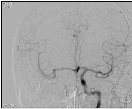
Figure 4 - DSA images showing right ICA test occlusion and good supplying of right ICA territory by left ICA injection