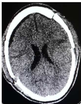
Figure 3 – NCCT head (Postoperative)