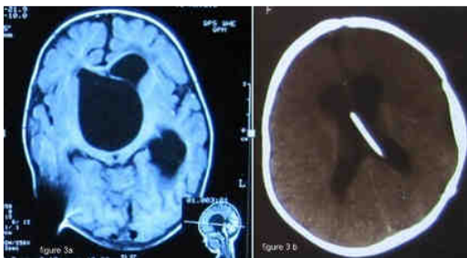
Figure 3a - Pre-operative CT brain of 8 years female having suprasellar arachnoid cyst presented with vomiting, headache and diminution of vision. Figure 3b - CT brain of post-cystoperitoneal shunt showing reduction in size of suprasellar arachnoid cyst

Surgical treatment of arachnoid cysts results in complications in eight patients. One patient had CSF leak which was controlled by conservative means. One patient developed wound infection which was treated with higher antibiotics. One patient developed subdural hygroma but fortunately it posed no problem in the patient.