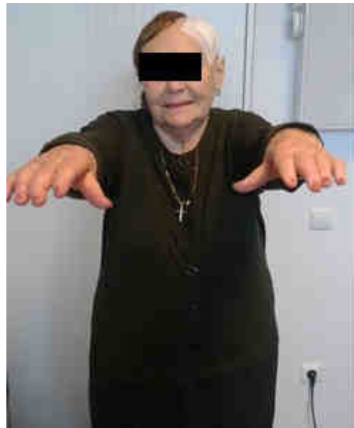
Figure 3 – 3 days after surgery, patient discharged

This case had, fortunately, a very favorable evolution, with restoration of the optimal neurological functionality. However, by adopting – for a longer time period – of the wrong therapeutic attitude, it could have evolved towards severe neurological deficits. (Figure 3).