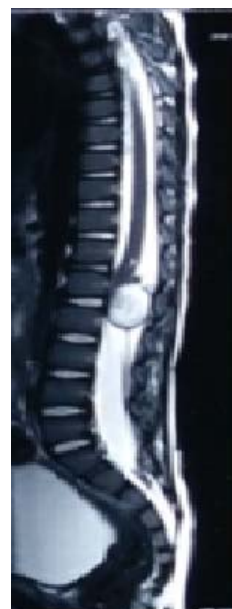
Figure 1 - Magnetic resonance imaging T2 weighted dorsolumbar spine, sagittal section image showing large hyperintense intramedullary conus lesion like gun barrel appearance

He underwent D12 to fourth lumbar vertebral level re-exploration of wound, after lamina removal, bulging dura was observed. midline durotomy was done (figure 4). A large cyst like gun barrel was seen, pushing cauda equina nerve roots anteriorly along spinal cord. A midline myelotomy was made and dermoid cyst decompression started and complete removal was carried out. Filum terminate was also divide, dermoid tumour was removed; It consisted of hair interspersed in the cheesy material. The cyst wall was thin. Histopathological examination of the resected specimen revealed typical feature of dermoid. Postoperative period was uneventful. At the last follow-up after three month following surgery, with improvement of power in lower limbs was noticed, he was playing and attending school.