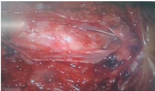
Figure 4 - Intraoperative photograph showing conus dermoid after dural opening