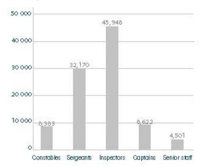
Figure 1: Rank distribution in the SAPS, Dec 2001

As Figure 1 illustrates, the SAPS has five and a half times more inspectors and nearly four times as many sergeants than constables. This distribution is absurd in terms of the functional responsibilities associated with these ranks internationally. Sergeants are generally assigned to supervise teams of constables, while inspectors are responsible for shifts of sergeants. Figure 2 shows the typical chain of command found in American police departments.