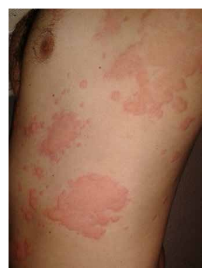
Typical urticarial skin rash

Angioedema occurs when deeper mucocutaneous layers are affected, temporarily disfiguring the face, eyelids and lips. Lesions are painful and can take up to three days to resolve. When occurring in isolation, the bradykinin pathway may be involved and the airway is more likely to be threatened. Angiotensin Converting Enzyme inhibitors are a common cause, even after longstanding use, and should be discontinued permanently. Hereditary or acquired deficiency, or functional impairment, of the C1 esterase enzyme should be also considered, especially if there is a family history of swelling, airway compromise or surgical complications indicating possible hereditary angioedema. Diagnostic tests include laboratory evaluation of C3, C4 and C1 esterase levels. Acquired C1 esterase deficiency may occasionally be linked to underlying malignant conditions.