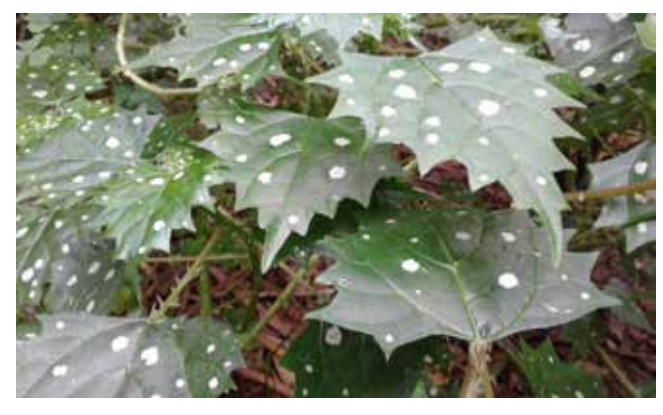
Urticaceae species stinging nettle plant

increased vascular permeability, following release of mediators by cutaneous mast cells.<sup>1-4</sup> Individual urticarial lesions usually resolve within 24 hours, without scarring, as the epidermis is not involved.<sup>5</sup> The rash is intensely pruritic and tends to 'migrate' or become confluent.