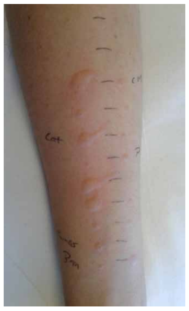
Skin prick testing for IgE mediated allergy

recent infections. Skin prick or ImmunoCAP specific IgE tests for specific allergens may be helpful. An example is recent onset of crustacean shellfish allergy in a patient who reports oral itching, wheeze and urticarial hives developing within hours after eating shrimp in a restaurant.