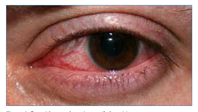
Figure 3: Eye with non-ulcerative sterile keratitis (https://commons.wikimedia.org/wiki/File:Clare-314.jpg)

The mainstay of treatment is topical antibiotics and options include monotherapy with fluoroquinolones (ciprofloxacin 0.3% or ofloxacin 0.3% 1–2 drops hourly for 48 hours, then every 4 hours until healed) or some authors prefer fortified aminoglycoside/cephalosporin combinations (fortified cefalotin