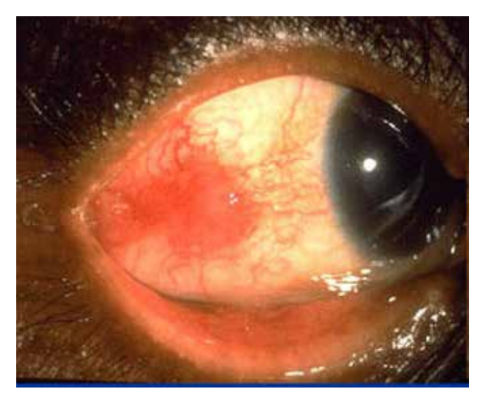
Figure 1: Clinical clue for MCQ scenario

A 30-year-old male presents with an acute episode of bilateral red eye with mild pain and irritation in both eyes for the last 3 days with a watery discharge (see Figure 1 below). He is otherwise well with no symptoms on systemic enquiry and he has no other known medical problems. The most appropriate next step in his management is to prescribe: