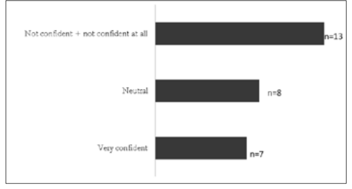
Fig. 2. Confidence levels of therapists when selecting assessments and providing therapy to bi/multilingual children with speech difficulties.

Twenty-five per cent (n=7) of the participants rated themselves very confident or confident about selection of assessments and providing therapy to a child who speaks another language to their own; 29% (n=8) rated themselves as neutral in this regard; 46% (n=13) rated themselves as not confident/not confident at all. Figure 2 shows these data.