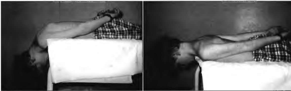
Figure 5. Postural correction and reversal exercise

signs and symptoms and an increase in the endurance capacity and lengths of the relevant muscle groups. There was a steady decrease in the frequency of all symptoms with the greatest improvement occurring in weeks 5 and 6.