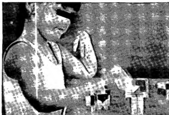
Figure 5: Case 5. The post-operative result was poor.