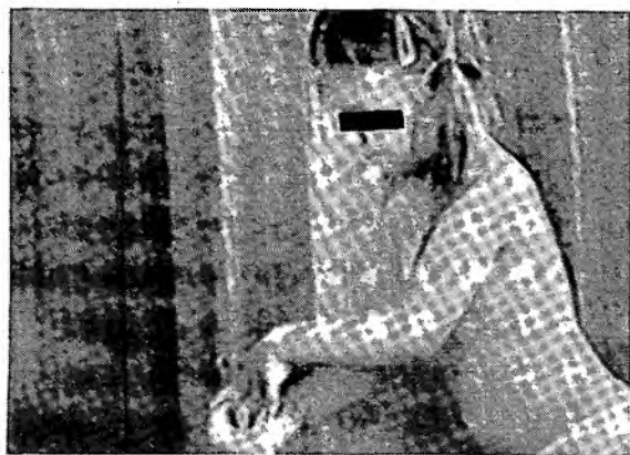
Figure 4: A pre-operative picture showing marked wrist flexion and finger extension. The thumb is not visible.