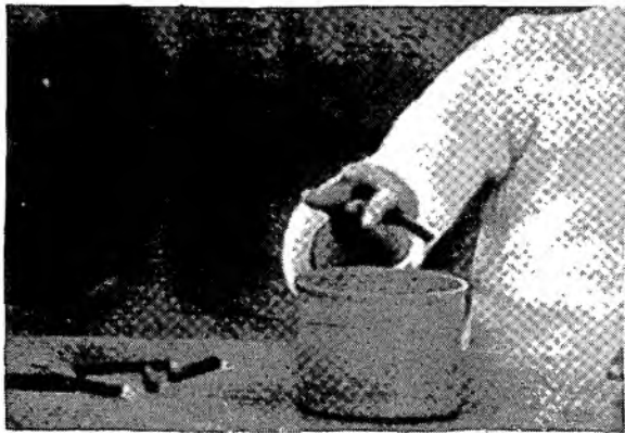
Figure 1: A pre-operative photograph of Case 1 showing the thumb in the palm of the hand. All photographs were taken from video recordings

pollicis was released from its insertion into the proximal phalanx of the thumb.