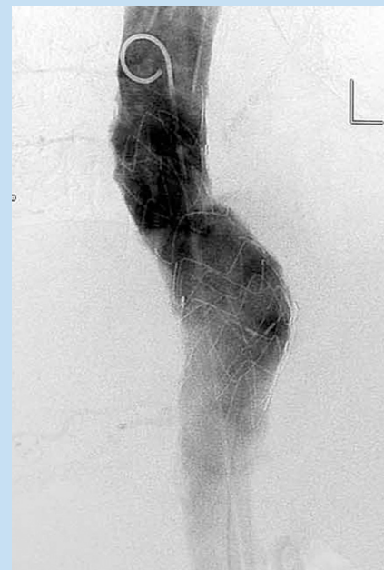
Fig. 1b. Post-procedural image after stent graft implantation.

clamping and cardiopulmonary bypass. (Fig 1a, b). The mortality rate for endoluminal repair is usually 5% or less. 14, 15 The anaesthesia-related risks can now be minimised with