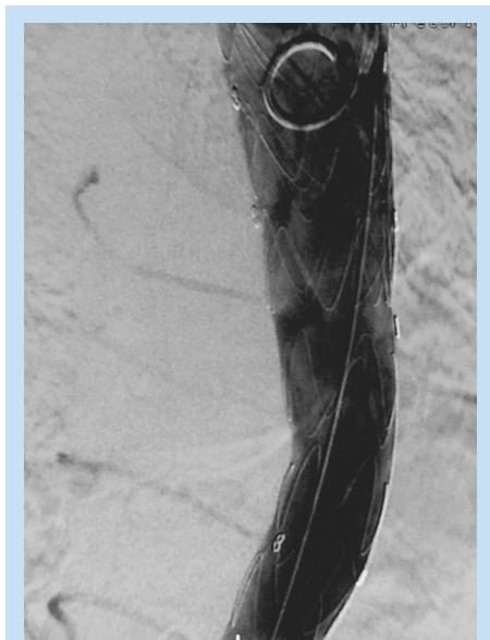
Fig. 2b. After coverage of the entry site with a stent graft device.

The risk of rupture is also higher in dissecting aneurysms when compared with degenerative aneurysms. 22 Older age, chronic obstructive pulmonary disease and an elevated mean blood pressure increase the risk of rupture. 23 Between 20% and 40% of patients who have passed their acute phase