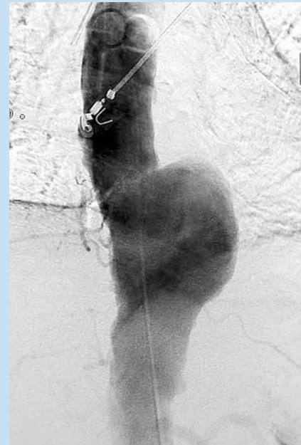
Fig. 1a. Pre-operative angiogram of a 70-year-old male patient with a degenerative aneurysm in the descending thoracic aorta.

The natural history of a thoracic aortic aneurysm is poor, with a rupture rate of approximately 50% when untreated. 7-9 The five-year survival rate ranges from 13% to 39%. The size of a thoracic aneurysm at the initial evaluation appears to be the most important predictor of rupture. 8 Thoracic aneurysms seem to enlarge at a more rapid rate than abdominal aneurysms. Although surgical repair has improved, it still carries a high mortality, ranging between 10% and 16% and is associated with severe morbidity. 10-13 Advanced age and emergency procedures increase mortality and morbidity. 11 Complications of surgery include death, myocardial infarction, renal failure, haemorrhage, chest infections and paraplegia. Spinal cord injury is reported in 2.3% - 6.5% of patients. The morbidity can be reduced with a less invasive procedure that spares a thoracotomy, aortic cross