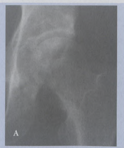
Fig. 2 a. Several months later plain film studies show healing of the fracture with normal alignment but no features of avascular necrosis.