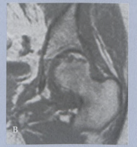
Fig. 2b. Coronal TI-weighted MR image obtained 5 months later showing evidence of avascular necrosis in the superior aspect of the femoral head. There is no artifact due to the screws, allowing clear visualisation of these changes.

tion and evidence of healing of the femoral head with no evidence of avascular necrosis (Fig. 2a). A magnetic resonance (MR) scan was obtained which showed no magnetic susceptibility artefact due to the presence of the polylactic acid screws (Fig. 2b).