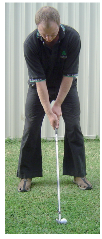
Fig. 1. The address position.