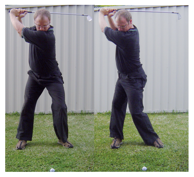
Fig. 5. The modern top of backswing (left) compared with the classic top of backswing (right).

The lateral aspect of the left foot lifts off the ground and more weight is borne on the right foot, depending on how much right lateral weight shift the upper body performs. Scientific literature suggests 60-80% of the weight is borne on the right side,<sup>2,43</sup> while literature from golf professionals suggests the upper limits of this figure.<sup>1</sup> The right side of the pelvis acts to stabilise the swing at this point. The main difference in the backswing of the classic swing is that there is a large pelvic turn (also known as hip turn) to accompany the upper body turn (Fig. 5). As a result of the increased hip turn, the separation angle between shoulder and pelvic rotation is less, resulting in less torque being placed on the lower back in the classic swing. More right lateral weight shift is seen in the classic swing compared with the modern swing.