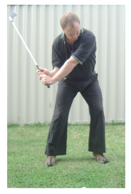
Fig. 3. Downswing phase.

tation and PGA tour and amateurs displayed nearly 90° rotation. In contrast, Burden et al. <sup>6</sup> in 1998 found an average of nearly 110° in a study of 8 sub-10 handicap golfers, with one golfer displaying a shoulder rotation of over 130°. The rota-