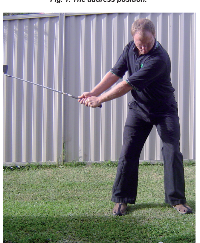
Fig. 2. Backswing phase.

tation and PGA tour and amateurs displayed nearly 90° rotation. In contrast, Burden et al. <sup>6</sup> in 1998 found an average of nearly 110° in a study of 8 sub-10 handicap golfers, with one golfer displaying a shoulder rotation of over 130°. The rota-