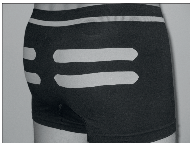
Fig. 5. Postero-lateral view of the neutral placebo KT application method (group B).

Subjects completed a standardised dynamic warm-up of 10 body-weight squats, lunge walks for 10 metres and buttock kicks for 10 metres. Thereafter each subject performed 5 CMJs at the Vertec at sub-maximal effort as training to decrease bias because of the learning effect. 27 Five practice jumps have been shown to adequately reduce the effect of learning on improvement of the outcome measure. 29