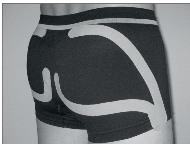
Fig. 3. Postero-lateral view of the Y-strip KT application method (group A).

wide were used. The tails of the Y were 30 cm long and 2.5 cm wide, leaving a base of 5 cm (the estimated distance between the subject's greater trochanter and fifth lumbar (L5) spinous process). Subjects were asked to lie on their sides with the hip in neutral alignment. The base of the kinesio tape was stabilised and the anterior tail nearest to the clinician was taped to the iliac crest with tape tension of between 50% and 75%. Subjects were then asked to flex, adduct and internally rotate the hip and flex the knee. The kinesio tape was stabilised and the posterior tail was attached to the sacral base, enclosing the gluteus maximus muscle, with the tape tension again between 75% and 100%.