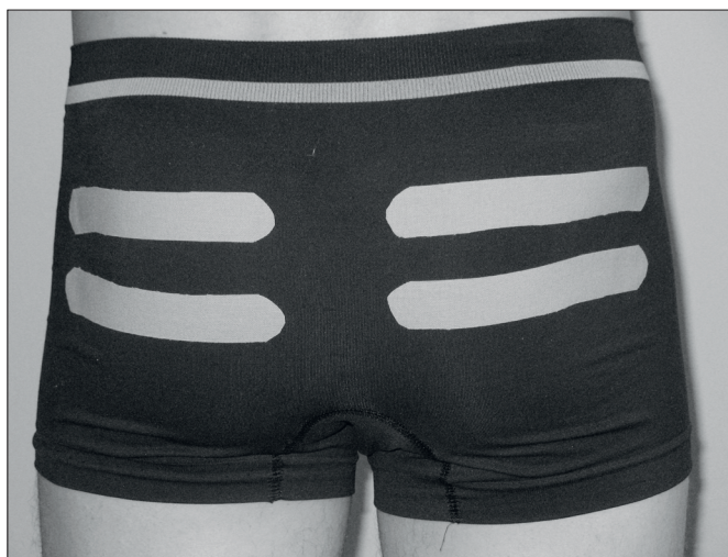
Fig. 4. Posterior view of the placebo I-strip placebo KT application method (group B).