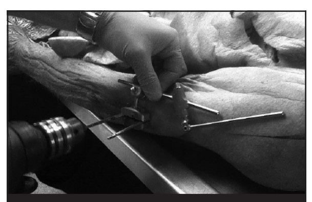
Figure 1b. Insertion of the proximal and distal pin with the use into the left arm of a cadaver

Table I: Incidence (%) of radial nerve damage in a South African cadaver sample (n = number of cases out of total sample)