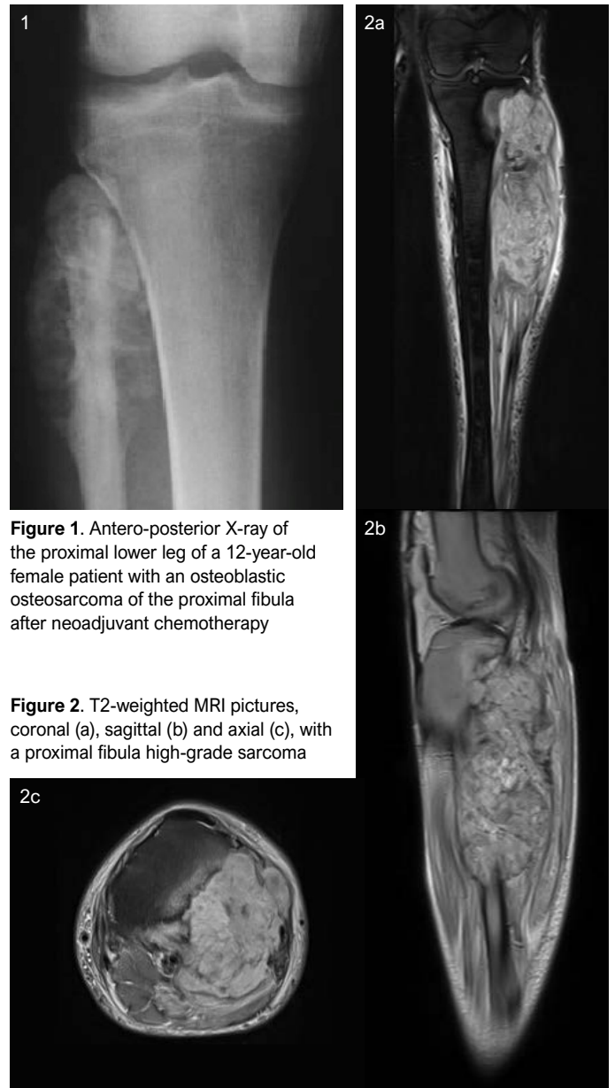
Figure 1. Antero-posterior X-ray of the proximal lower leg of a 12-year-old female patient with an osteoblastic osteosarcoma of the proximal fibula after neoadjuvant chemotherapy

Follow-up was performed by the oncologists for the high-grade malignant lesions and included a chest X-ray and clinical examination every three months for the first two years, six monthly for years 2–5 and annually for years 5–10, at which point the patient was discharged. The patients with aggressive benign lesions or low-grade malignant sarcomas were followed up by the orthopaedic surgeons with clinical examination and X-ray of the lesion every six months until discharge at two years. A Musculoskeletal Tumour Society (MSTS) score 11 was performed at final follow-up.