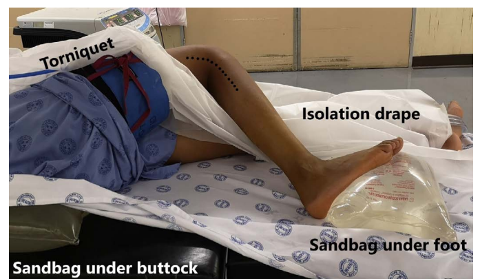
Figure 3. Illustration showing patient positioning and utilitarian incision with biopsy scar included for both type I and II resections

At a median follow-up of 38 (6–123) months the clinical notes including the MSTS score, imaging and histology were reviewed. Descriptive statistical methods are used to present our findings. No further statistical methods were deemed necessary as no comparisons are being made and patient numbers are small.