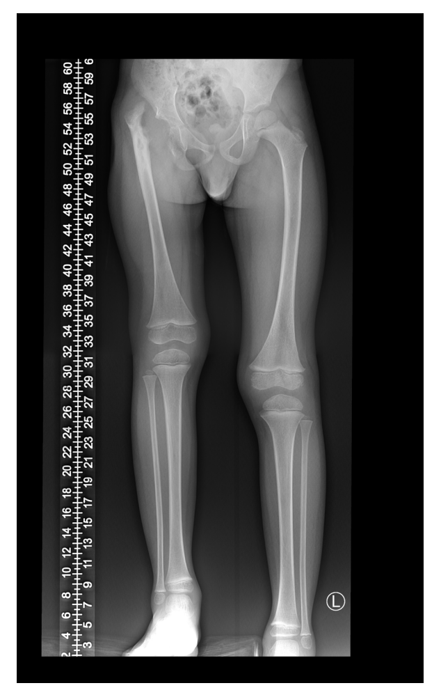
Figure 4 . Leg length views of a 2-year old boy who developed AHO of the right femur with associated septic arthritis of the right hip as an infant. He has developed AVN of the right hip resulting in an unstable hip joint and a significant leg length discrepancy.

related to the development of complications. Univariate analysis indicated that the patient's age may be significant; however, in the multivariate analysis, this was not confirmed (p=0.15).