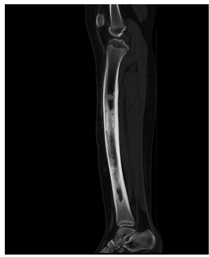
Figure 3. CT scan of the left tibia taken five years following onset of AHO in a 11-year-old girl. There is evidence of intramedullary sclerosis and sequestrum.

d, e). AP and lateral projections of the left femur 14 months following sequestrectomy and bone grafting. The bone graft has incorporated fully and there is no residual deformity.