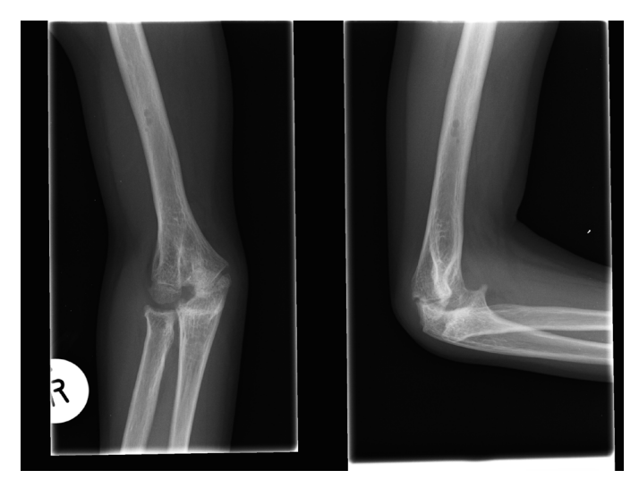
Figure 5 . AP and lateral projections of the right elbow in a 6-year-old girl. She developed multifocal staphylococcal septicaemia two years prior with involvement of both hips, her left tibia and the right proximal ulna and elbow. X-rays demonstrate AVN of the trochlea and radial head with ankylosis of the elbow joint.

This study aims to highlight the complications and outcomes associated with osteomyelitis of the long bones in children where the disease is sufficiently advanced to require surgical