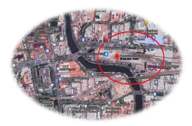
Figure 1. Location of Surabaya City Station

The location of the Surabaya Semut Station where the research was carried out is located at Station Kota Street No. 9, Surabaya, East Java 60161.