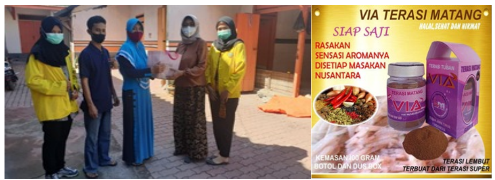
Fig.2. Documentation of activities with Terasi Rebon SME partners and technology transfer