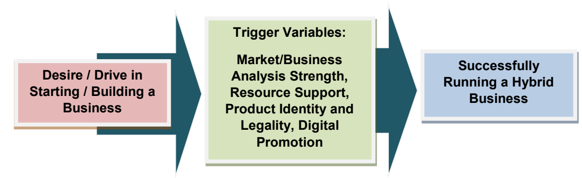
Figure 1. The process of the emergence of a hybrid entrepreneur.

Through the picture below, we can find out how the role and influence of each independent variable on the formation of strengths and the development of hybrid entrepreneurs. In full it can be displayed as follows: