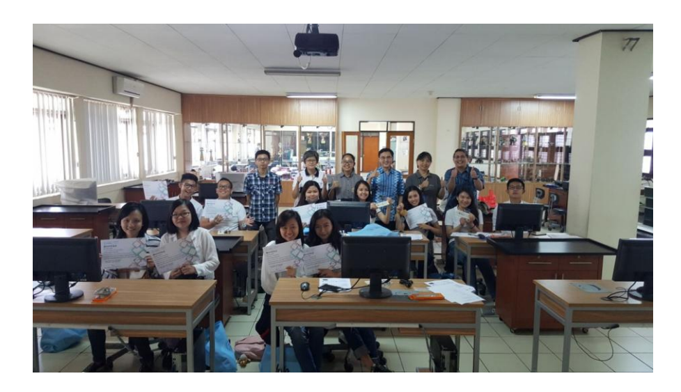
Figure 6. In part of participants of PKM Arduino activity

International Journal of Society Development and Engagement Volume 1 Number 1 2017 ISSN : 2597-4777 (Online) – ISSN : 2597-4742 (Print) This work is licensed under a Creative Commons Attribution- ShareAlike 4.0 International License.