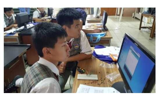
Figure 3. High school students are learning to program with the Arduino IDE software

International Journal of Society Development and Engagement Volume 1 Number 1 2017 ISSN : 2597-4777 (Online) – ISSN : 2597-4742 (Print) This work is licensed under a Creative Commons Attribution- ShareAlike 4.0 International License.