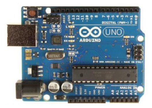
Figure 1. Arduino Uno

Heri Andrianto and Aan Darmawan in their book of Arduino[1] said that Arduino is an open source electronic kit specifically designed as a controller that regulates the workings of other electronic circuits, to facilitate the users either technicians, designers, and anyone interested in creating objects or developing electronic devices which can interact with a variety of sensors and electrical equipment. In the devotion to the community used Arduino Uno which can be seen in Figure 1