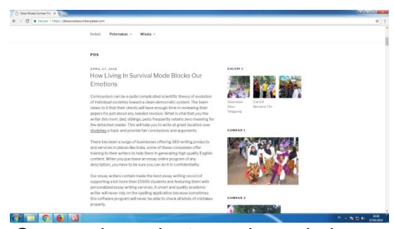
Figure 1 Sumber Pakel Tourism Village Website

WordPress is a popular application used to create a blog. This application uses the PHP programming language and driven. Database MySQL Both are open-source software. It can be used as a blog, WordPress also has begun to be used for a CMS (Content management system), this is due to its ability to be easily modified and adapted to the needs of the user. Currently, the WordPress into a content management system platform for some of the leading sites such as CNN, The New York Times, TechCrunch and so on. (Id.wikipedia.org/wiki/WordPress).