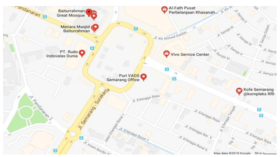
Figure 2 Research sites

This work is licensed under a Creative Common's Attribution-ShareAlike 4.0 International License.