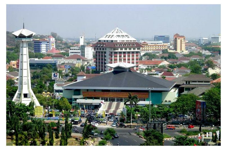
Figure 3 Seen in front of the research location in front of Baiturrahman Great Mosque in Semarang